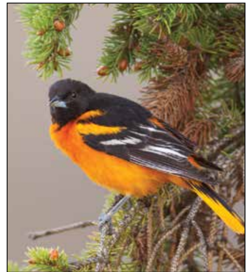
Top photo: This Short-eared Owl was photographed by David Yeany during the snowy Bird Count.

The Baltimore Oriole was found by a first-year participant at his feeder in O'Hara Township. The bird was coming to a woodpecker feeder, presumably picking dried raisins from the food blend. The oriole is the perfect example of how a single person interested in birds can