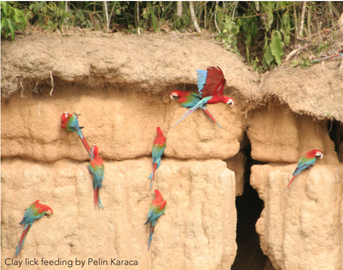
Clay lick feeding by Pelin Karaca